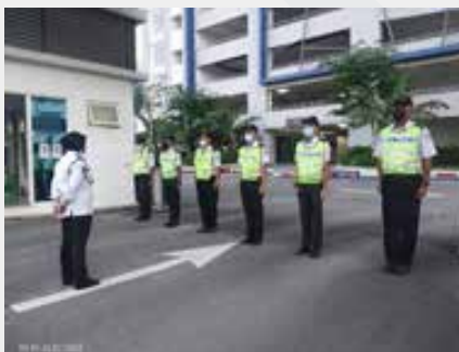
Roll Call At The Site