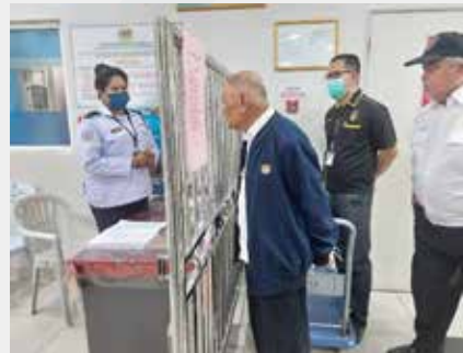
Chairman's Visit To The Site