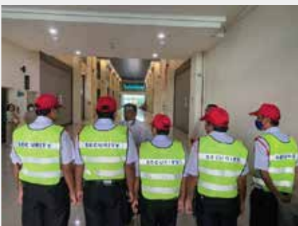
Nepal Guards Update & Briefing