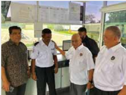
Directors Visit To The Site